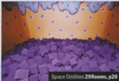
Space Oddities 29Rooms, p20