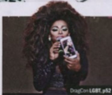
DragCon LGBT, p52