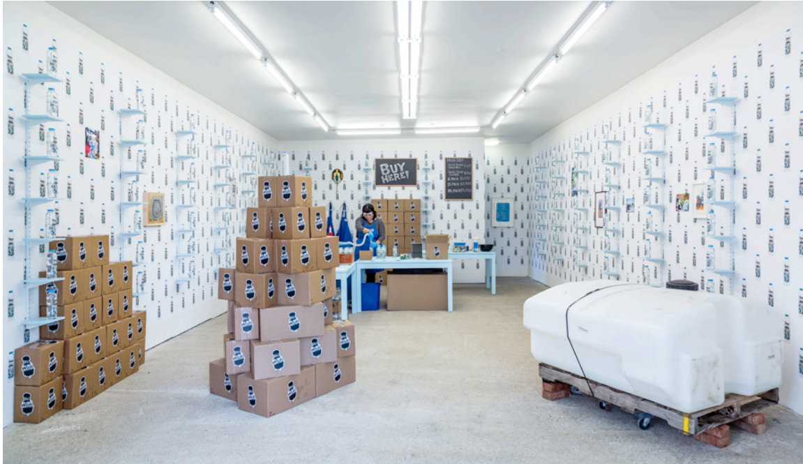
Pope.L, Flint Water , 2017, installation view, What Pipeline, Detroit.

The evening concluded with a spirited Q&A, in which one audience member asked why art and protest had to adopt the strategies of mass culture. Fusco replied that protest culture had turned toward spectacle since the 1999 World Trade Organization demonstrations in Seattle. 'What you're asking for is a return to citizenship that disappeared when we became consumers,' she said.