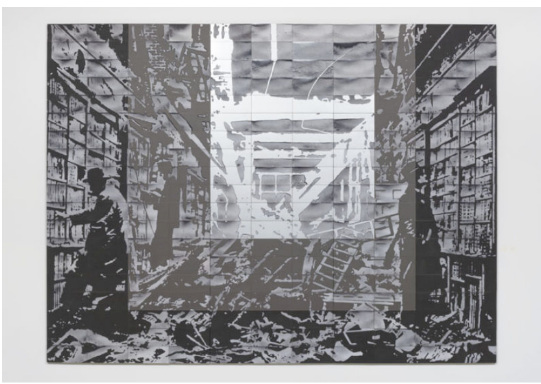
Mary Kelly, Circa 1940 , from Circa Trilogy , 2004–16, 2015. Compressed lint and projected light noise. 95 1/2 by 127 by 1 1/2 inches.

In The Practical Past Kelly's probing of the concept of women's work persists. Every object in the show is composed of accumulated lint from a household clothes dryer, a medium with which Kelly has worked for nearly twenty years. The idea of women's work—that is, the tasks performed within the domestic sphere—is a concept that could sound hoary to a contemporary audience if it were not for the fact that the presence of dryer lint as a medium somehow still immediately marks the objects as specifically woman-made. The substance itself illustrates how deep our cultural conditioning runs.