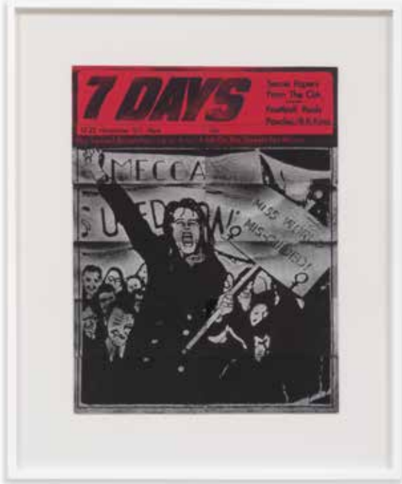
7 Days, 17-23 November, 1971, 2016