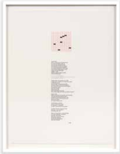
Unguided Tour circa 1968, 2016