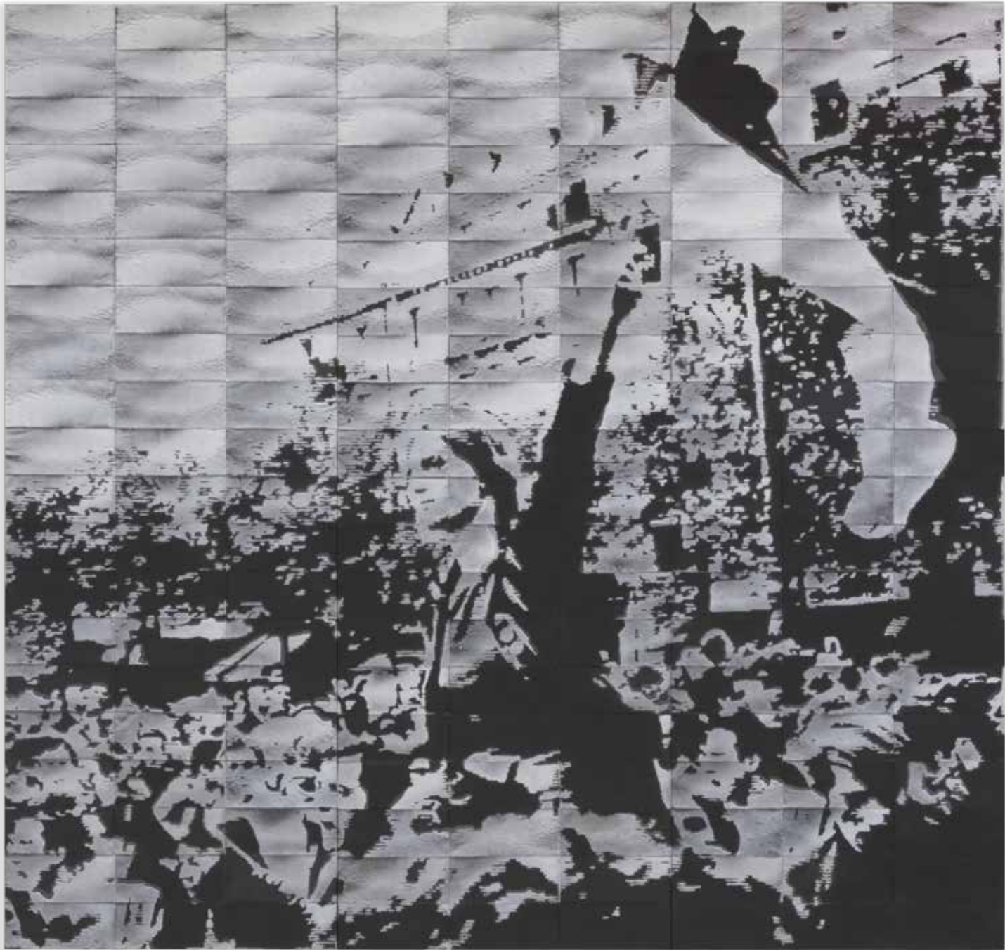
Circa 1968, 2004