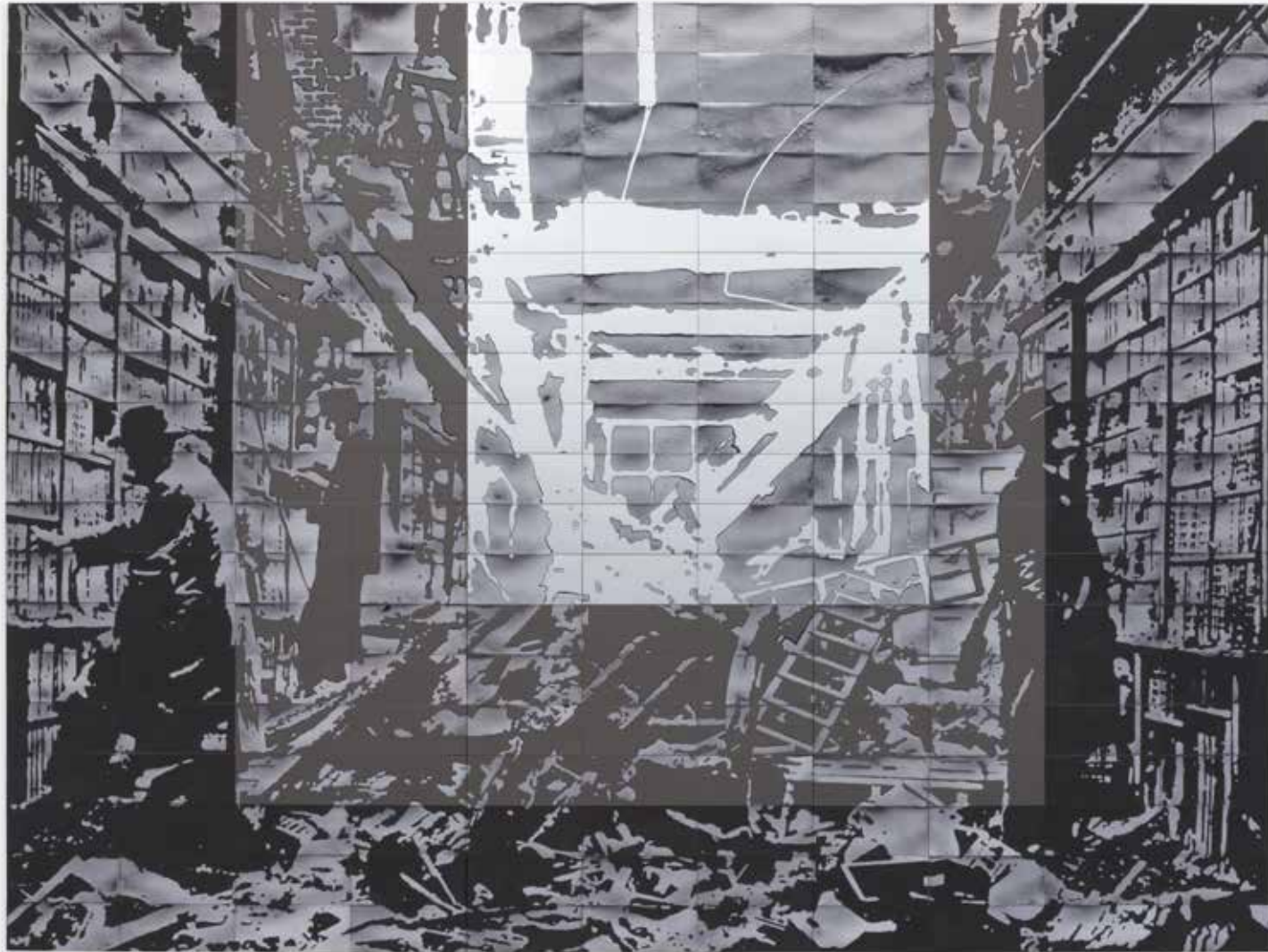
Circa 1940, 2016