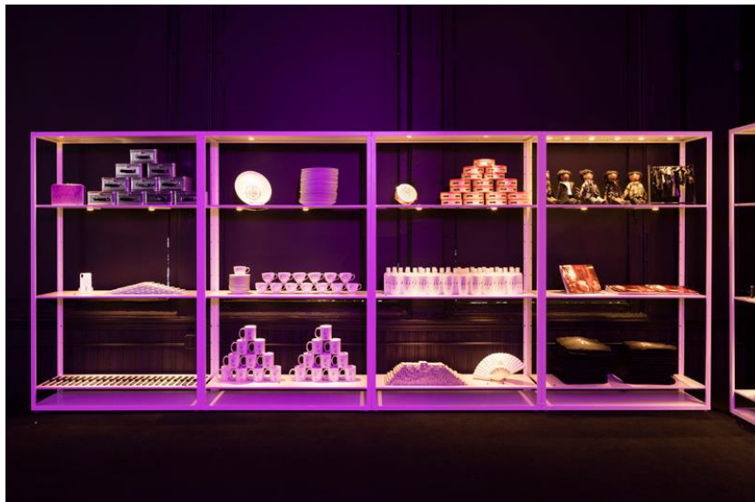
Jacolby Satterwhite, Blessed Avenue , installation view.

Created with a commercial computer software common for big-screen animations, whip-like serpentine lines emerge from performers’ limbs as a parade of contorted bodies in latex, housed in an apocalyptic cage, winds above. Neon tones of green, purple, and yellow prevail, while the scenery made up of amorphous objects, mostly based on Patricia’s sketches, meander through floating dance floors and towering domes. At one point, Satterwhite appears on a hover board, fervidly voguing in ecstasy while ogling the audience.