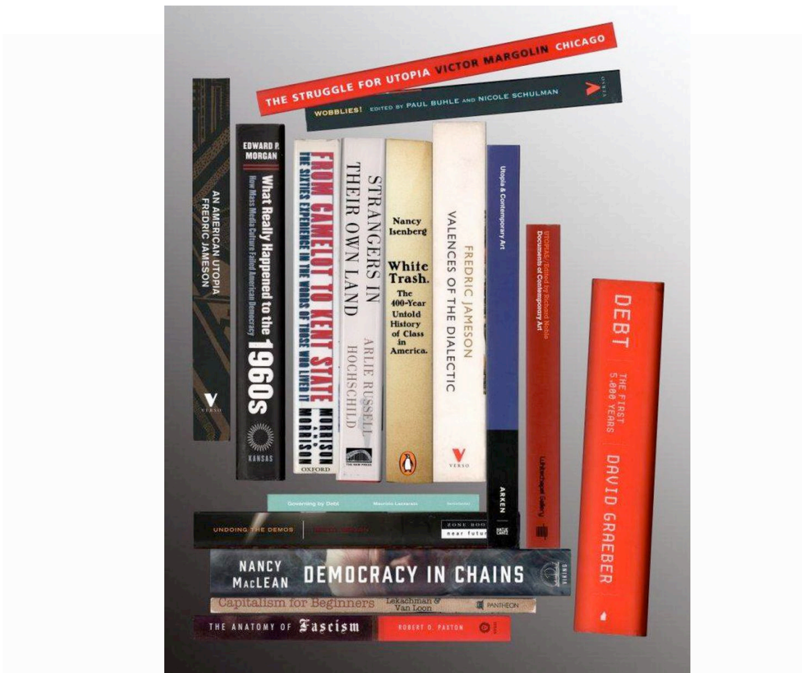
Martha Rosler. Capitalism, Democracy, 2018.

Goya's art making occurred during one of the most tumultuous periods in Spain's history. Rosler's has too. It would be a mistake to consider Rosler's work a call to action. It may be best to refer to it as a call to consciousness, awakening for a broad audience. In fact, she has asserted it is "didactic and expository; it makes an argument [ . . . ] Yet oddly enough my work isn't hortatory. It doesn't insist on an avenue of action, or say, 'Do this!' Ultimately it's more contemplative, in that it does not answer the questions it poses."