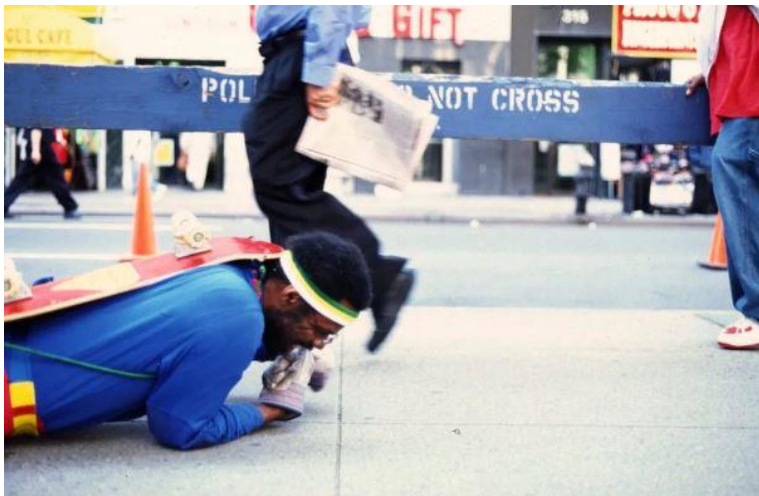
POPE.L, “The Great White Way, 22 miles, 9 years, 1 street,” 2000-09 (performance). | © Pope. L. Courtesy of the artists and Mitchell, Innes & Nash, New York

Chicago-based Pope.L participated in the 2017 Whitney Biennial and won that year’s Bucksbaum Award. Following his project focused on the water crisis in Flint, Mich., he has created a new installation that further explores the use of water. “Choir” is “inspired by the fountain, the public arena, and John Cage’s conception of music and sound.” The show is part of “Pope.L: Instigation, Aspiration, Perspiration,” a trio of complementary and coinciding exhibitions organized by the Whitney Museum, Museum of Modern Art, and Public Art Fund (which presented “Conquest,” a collective performance on Sept. 21).