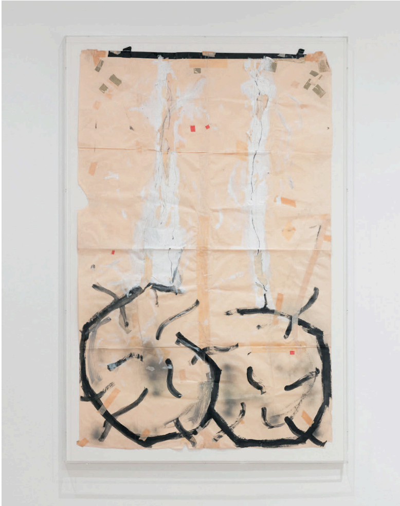
Pope.L, Egg Eating Contest (Basement version) , 1990, acrylic, pressure-sensitive tape, spray paint, and ballpoint pen on paper, 65 1/2 x 42". © Pope.L.

Cutting in all directions, the monologue inflates tropes of black cultural nationalism until they become vulgar, silly, and impotent. The video concludes when the protagonist is electrocuted by his white assistant, although this was not the end of the performance. These works in the screening room are the only extant recordings of much of Pope.L's early theater work, and nearly all of them conclude this way—that is, abruptly, often cutting out mid-sentence. Also in this room, an artwork— Package Received but Never Opened #21 , 2017, a gift basket wrapped in clear cellophane—is tucked away behind the screen and illuminated by a dramatic red light. A second work of mail art, Package Received but Never Opened #167 , 2015, a parcel wrapped in brown paper, is installed high on a platform in a corner. Notably, along with the Failure Drawings on scrap paper scattered throughout the galleries, these fall outside the exhibition's chronological scope; they are among its only “autonomous” works, pieces of art in their own right, distinct from the stage props, costumes, ephemera, and other relics of live performances that constitute the majority of objects