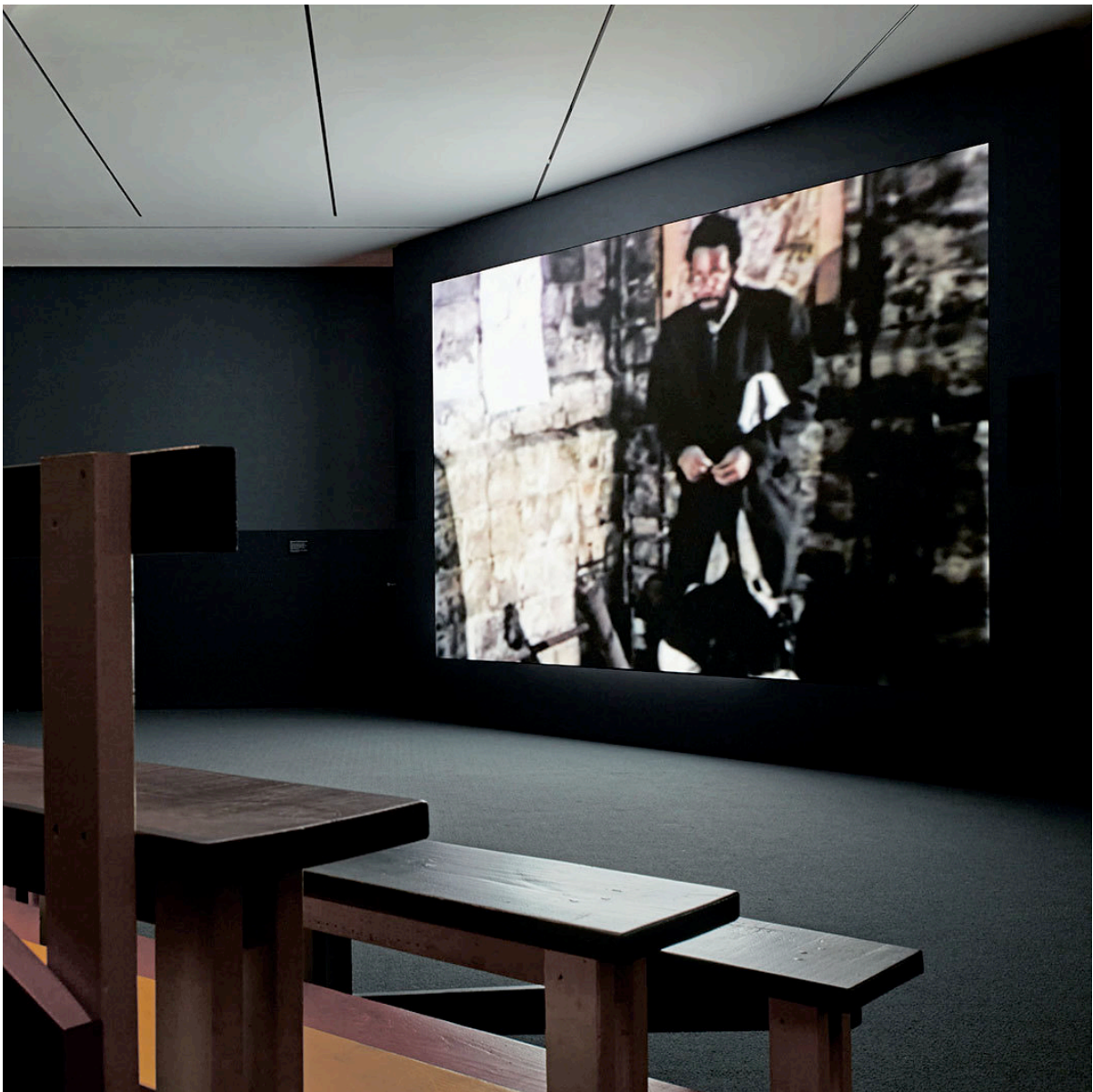
Pope.L, Egg Eating Contest (Basement version) , 1990, video, color, sound, 8 minutes 4 seconds. Installation view, Museum of Modern Art, New York, 2019. Photo: Martin Seck. © Pope.L.