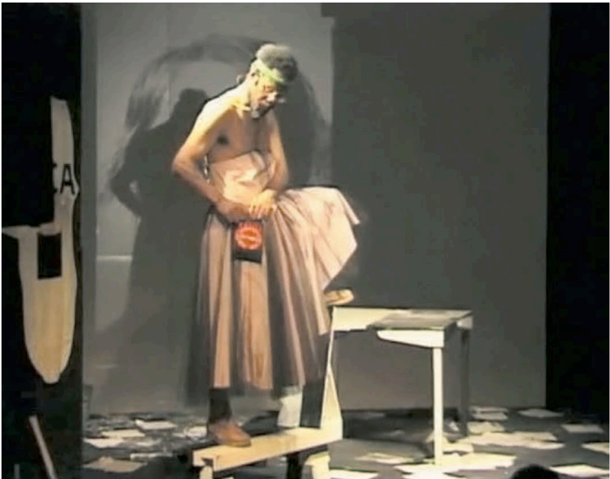
Still from Pope.L’s Eracism (version 8b) , 2000, video, color, sound, 10 minutes 24 seconds.

2004–2006—a project in which he and a team of assistants traveled around the United States in a delivery truck asking people to donate objects that represent blackness—as a work of theater. In his early days, he says, he would have called the idea “too-too-too fancy pants!,” preferring instead “a floppy, goofy, stupid proscenium.” A collection of the donated objects is installed in a hallway, marking a transition from experimental theater to full-fledged contemporary performance art—“the white biz,” as he calls it in Aunt Jenny . He attributes his arm’s-length relation to both “Theater” and “Art” to the influence of his grad-school adviser, Fluxus artist Geoffrey Hendricks, from whom he adopted the general attitude of that movement: “learned but stupid, fancy but poor, funny but sad.”