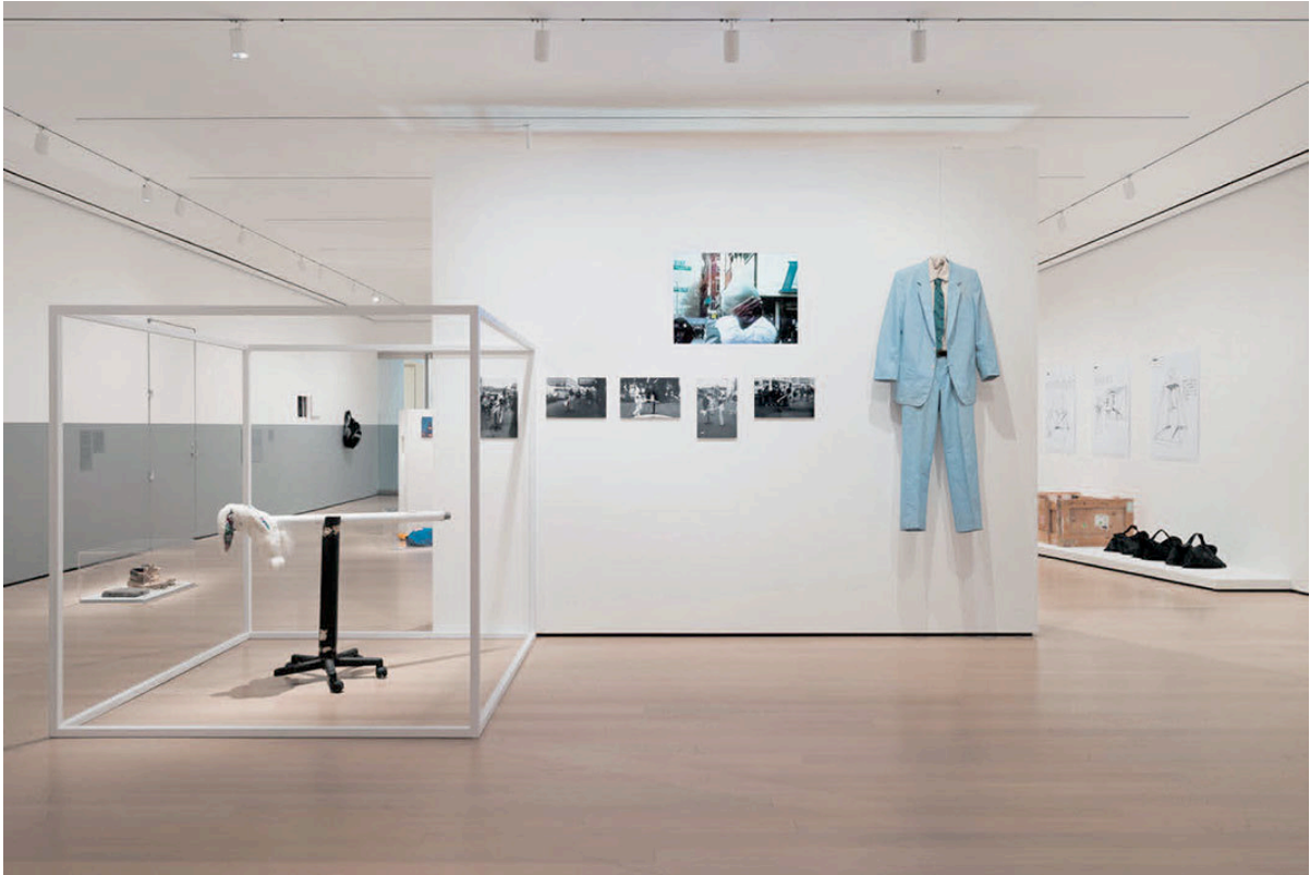
View of “member: Pope.L, 1978–2001,” 2019–20, Museum of Modern Art, New York. Center: Member a.k.a. Schlong Journey, 1996.