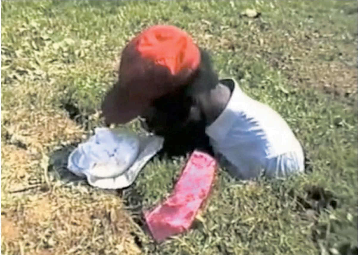
Pope.L, Sweet Desire a.k.a. Burial Piece, 1996, video, color, sound, 4 minutes 19 seconds.

Beyond taking aim at the usual suspects (white liberal philanthropy, blue-chip galleries, racial essentialism, black bourgeois respectability, “patriarchy in general”), Pope.L deploys his anarchic approach in lacerating self-examination. He suspects his own motives and questions the sincerity of his critique. A poem published in Performance Journal in 1991, partially reproduced in the show, concerns the suspicion that his street performances—particularly the famous crawls, in which he pulls himself, at great harm to his body, through the gutters of New York—are ultimately self-serving and amount only to his “pretending to suffer.” But his guilt about having a “good job in bad times” passes over into something careless. “Cashing my paycheck over the bodies in Palestine / See ’em laid out like Jewry on the Bowery.” The middle term, “Jewry,” is absent from the version of the text reproduced on a gallery wall as a disordered facsimile reproduction of his 1992 artist book William Pope.L’s “How Much Is that Nigger in the Window” : Rap Street Journal , the pages of which are heavily redacted for poetic effect. But the discrepancy between the published and unreproduced versions raises an issue that goes to the heart of the show—what are the ends of profanation and provocation? Why the accented homophony here—the riff on jewelry and Jews? Why risk a conflation—