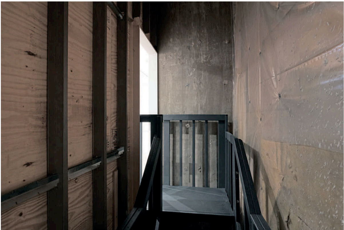
Pope.L, Snow Crawl , 1992–2001, wood, mirrors, cardboard, and video (color, sound, 7 minutes 42 seconds). Installation view, Museum of Modern Art, New York, 2019. Photo: Martin Seck. © Pope.L.

gets removed within seconds. The apparent prompt for the performance, the wall text informs us, was a then-recently passed New York law making it illegal to ask for money within ten feet of an ATM. Pope.L, like the ancient kynic Diogenes, plays the fool whose own disturbed behavior reveals the insanity of the social order. But, to foreclose the possibility of strangers' experiencing his antics as work, possessing determinate social and historical content, he layers the action with nonsense until it is politically unintelligible to his audience of police and passersby—indistinguishable from a common bit of street madness. The more urgent or pressing the social issue that's made the substance of the piece, the more its purported commitments are diffused with visual gags.