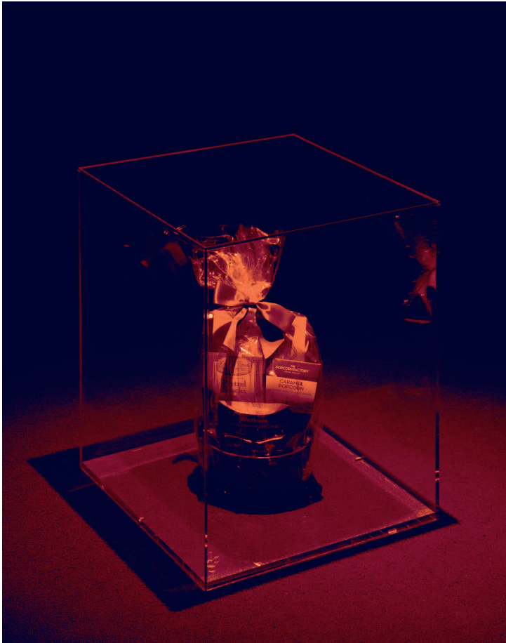
Pope.L, Package Received but Never Opened # 21 , 2017, Maisie's Savory snack mix, The Popcorn Factory caramel popcorn, Emilie Roux Pretzel snacks, Walker's Belgian chocolate cookies, Ghirardelli dark chocolate blueberry squares, ceramic bowl, clear plastic, silk ribbon. Installation view, Museum of Modern Art, New York, 2019. © Pope.L.

in the show. Foregrounding their status as mute, satirically self-contained sculptures, they throw into relief the difficulty of critically engaging with the videos, which are replete with moral provocations that cannot be adjudicated on the basis of these excerpts, none more than a few minutes long. To get ahold of the internal dynamics of these performances, we would need access to their full narrative arcs, some window into the totality of their abrasive propositions.