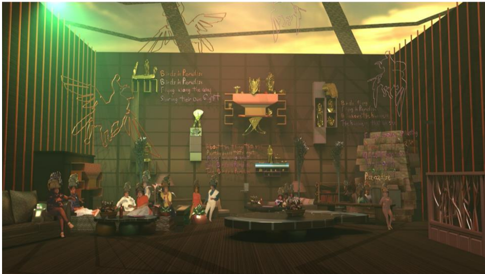
Jacolby Satterwhite, Vintage Paradise , 2019. Video still. Virtual reality video with sound. © Jacolby Satterwhite. Courtesy of the artist.

instead becoming a fluid body that is freed from such constraints and able to perform a new version of the self within this virtual space. The emoji patterns, out of their usual context, read as simple colors and shapes. Hart acts as a cinematographer, director, and architect within the virtual world of Alice Unchained , using 3-D animation in order to queer the construction of bodies and space alike. When experiencing Hart's creation through a VR headset, the viewer is directly immersed within the piece, navigating their own body (or lack thereof) through the same virtual world that the avatar inhabits.