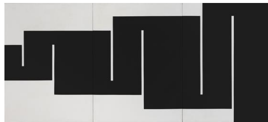
Julije Knifer: H.d Tii Tri v. 1975 I , 1975, acrylic on canvas, three panels, 67 by 4 1/4 inches each.

wall mural, though the work lacks the compositional tension that animates architectural interventions like Tü E (Tuebingen Ecke), 1973, in which an unbroken meander, as if absorbing the contours of the room, winds between two canvases placed on adjacent walls in a corner of the gallery. While Knifer's works are individually compelling, the exhibition makes clear that his meanders are most effective in aggregate, viewed as almost interchangeable segments of a single project. As he wrote in his koan-like 1977 text Notes , "I have probably already created my last paintings, but maybe not yet the first ones."