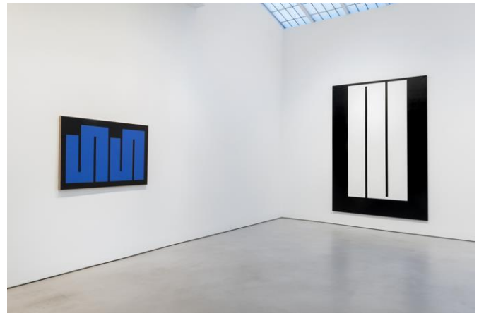
View of Julije Knifer’s exhibition “Meander,” 2020, at Mitchell-Innes & Nash.

Knifer began painting the meander exclusively in 1959, around the time he cofounded the Zagreb-based proto-conceptual group Gorgona. Instead of a shared artistic program, the group’s members were linked by what they referred to as the “Gorgonic spirit,” a generally nihilist anti-art stance inspired by existentialist philosophy and the example of local prewar avant-gardes. Their most significant collective project was the “anti-magazine” Gorgona, publishing eleven artist-designed issues—including contributions from Dieter Roth and Harold Pinter—before the group disbanded in 1966; Knifer designed the second issue as a folded loop of connected pages with a continuous meander printed across them.