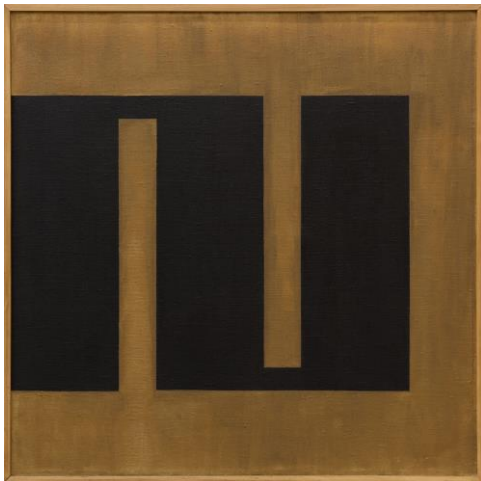
Julije Knifer: Untitled, 1969, acrylic on canvas, 24 by 24 3/16 inches; at Mitchell-Innes & Nash.

Titled, appropriately, “Meander,” the exhibition of Knifer’s work at Mitchell-Innes & Nash opened with two early pieces, displayed at the entrance, that show him in the midst of distilling his vocabulary, as if working out a problem. In the small, squarish painting Composition 15 (1959), stark black and gray geometric forms of different shapes and sizes create a sequence of right angles across the white ground. On the opposite wall, an untitled grid of thirty small framed collages (1959–61) displayed different configurations of linear black forms on white paper, spanning from an arrangement of vertical stripes to the prototypical meander: parallel verticals joined by narrow horizontal bands.