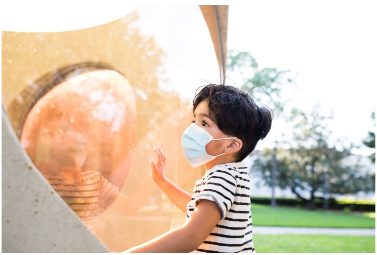
Sarah Braman (b. 1970) "Here" 2019

Winding through a one-mile stretch of the University of Houston's park-like campus is a series of colorful, bright, large-scale sculptures, offering visitors an emotional lift and escape to fun. Lace up your most comfortable shoes and feel the joy of color in " Color Field ," open to the public through May 31. Presented by Public Art of the University of Houston System (Public Art UHS), "Color Field<u>"</u> is an outdoor temporary exhibition featuring 13 works of art by seven contemporary artists.