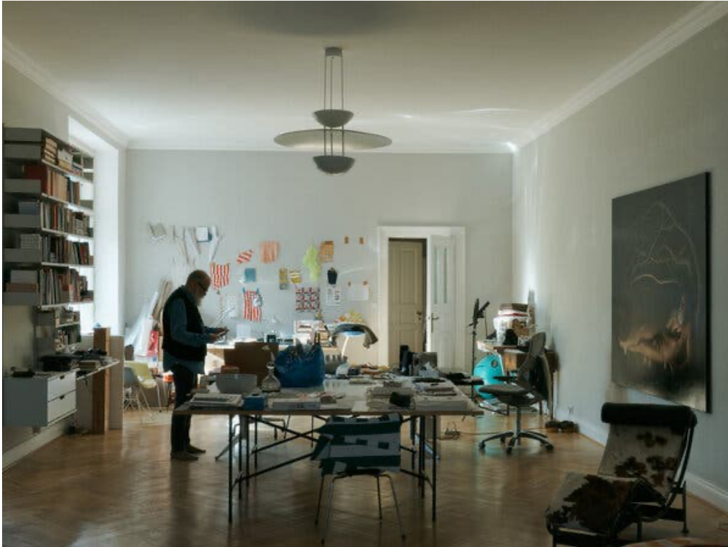
The artist AA Bronson at his studio in the Charlottenburg neighborhood of Berlin.