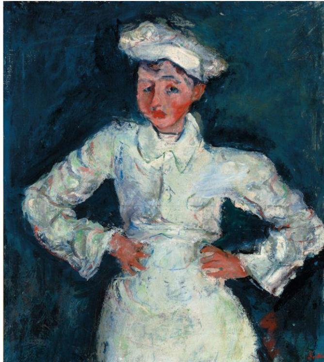
'Le petit pâtissier'(c.1927), by Chaïm Soutine

Rules in art exist to be broken but it takes chutzpah, which could explain why so many rule-breakers in modern figurative art were Jewish. Given that they were breaking the law by making figurative art in the first place, they went for broke.